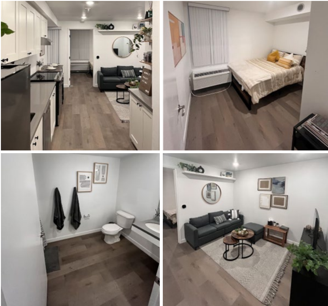
Sample Model/Z unit