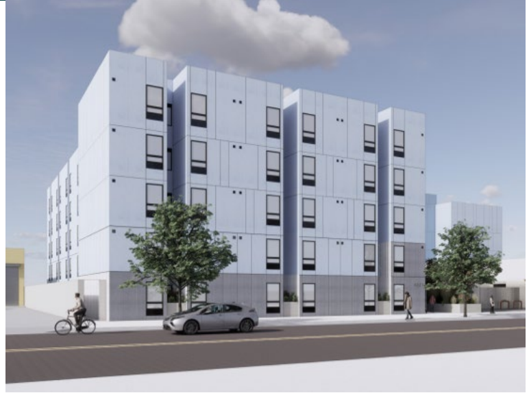
Current site condition and project rendering