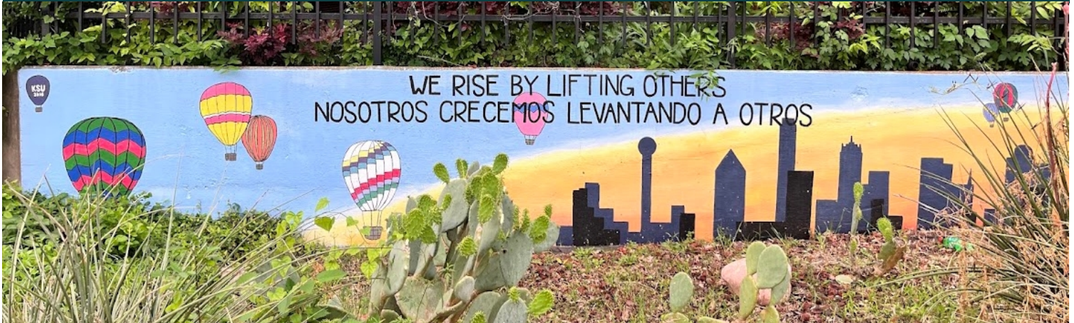
Mural in South Dallas near the project site